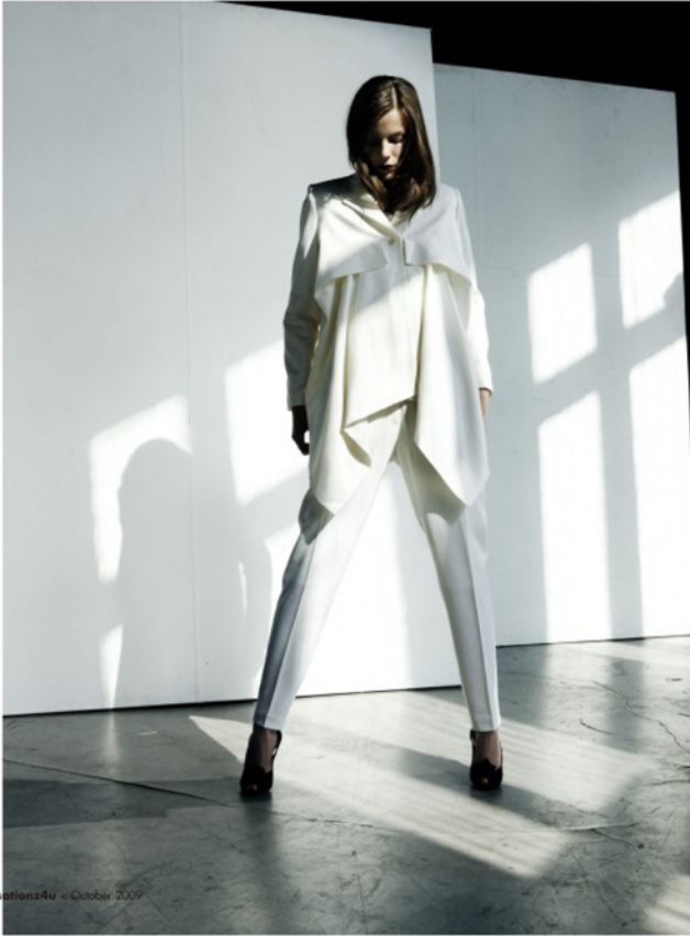
WHITE SILK-WOOL-MIX TROUSERS WITH FITTING DRAPED JACKET