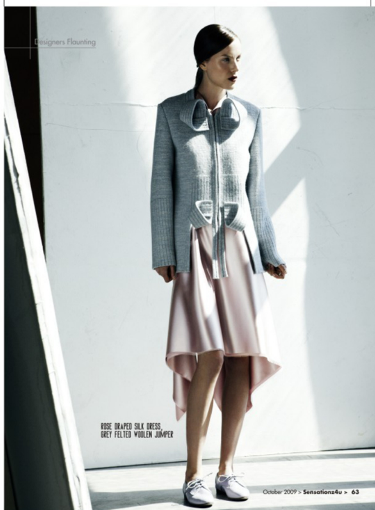
ROSE DRAPED SILK DRESS, GREY FELTED WOOLEN JUMPER