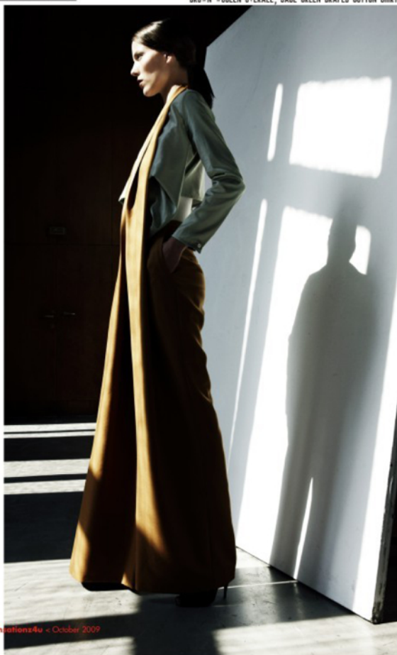
BROWN WOOLEN OVERALL, JADE GREEN DRAPED COTTON SHIRT