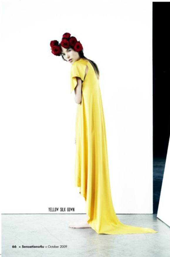
YELLOW SILK GOWN