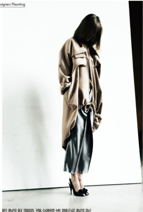
GREY DRAPED SILK TROUSERS, WOOL-CASHMERE-MIX DOUBLEFACE DRAPED COAT