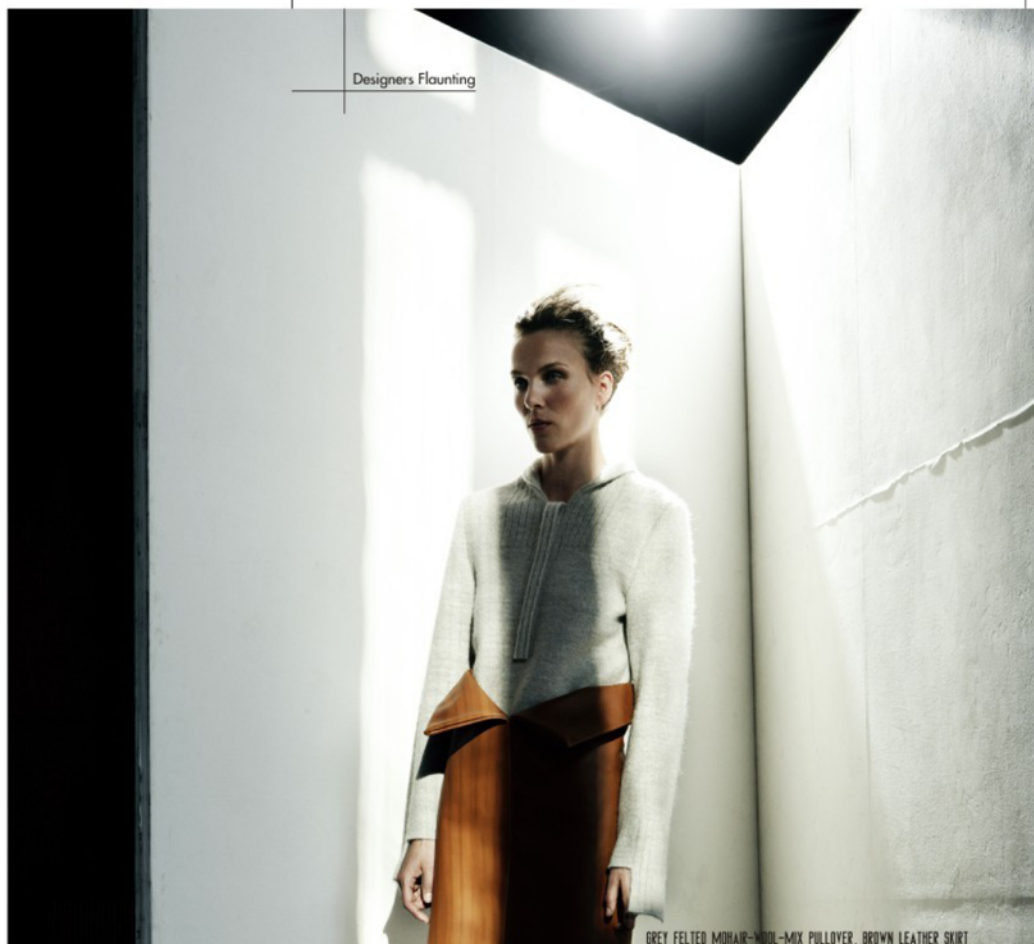
GREY FELTED MOHAIR-WOOL-MIX PULLOVER, BROWN LEATHER SKIRT